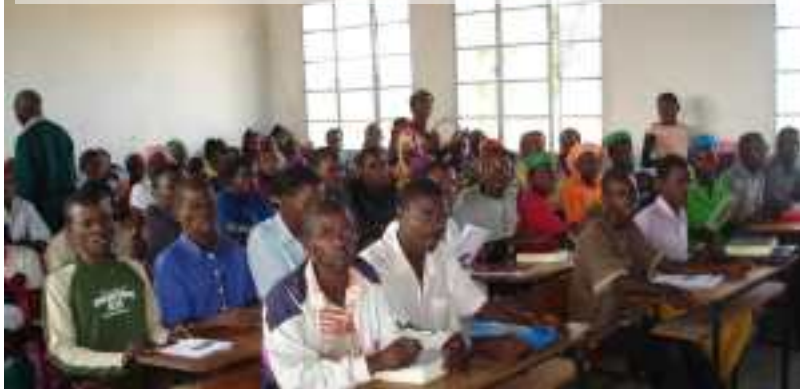
Catechists in Training Pungoe, Lebombo

Please do get in touch with us if we can assist you further: