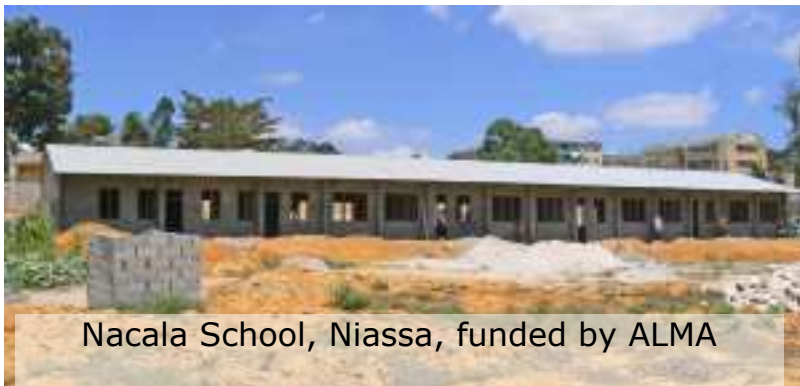
Nacala School, Niassa, funded by ALMA